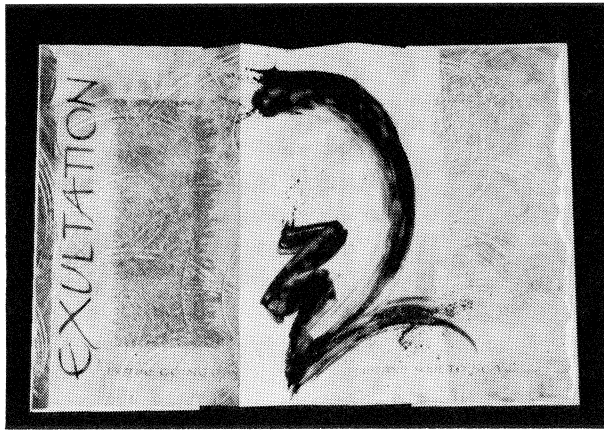
"Exultation," 1994. 25½" x 40" open. Gouache on paste paper.