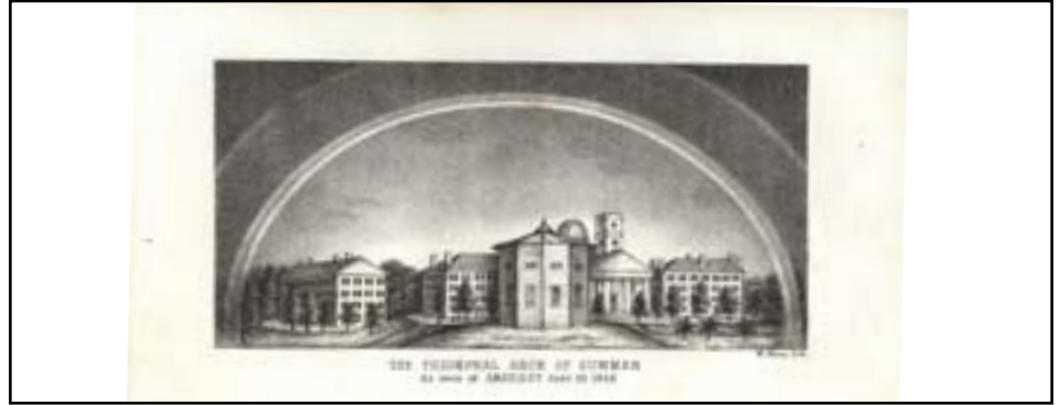
The Triumphal Arch of Summer as seen in Amherst in 1848. c. 1848 Pencil and ink wash study of Amherst College buildings and a rainbow, for a lithograph in E. Hitchcock's Religious Lectures on Peculiar Phenomena in the Four Seasons, 1850.