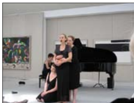
The Copland Quartet performing their theatre version of "12 Poems by Emily Dickinson"

Emily Dickinson’s short, subtle and precise descriptions of brief moments fascinate me; the dawn that gradually covers the lawn with darkness, the carefree flight of the bumble bee in the summer breeze, the imperceptible