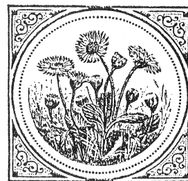
Flower of April — DAISY