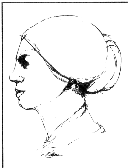
Profile of Emily Dickinson by Barry Moser

has been expanded many times through the decades. It contains extensive collections of first editions, biographical and critical studies, journal articles, dissertations, translations, photographs, recordings, videotapes, and artwork. Material of significant research value is added by gift and purchase. Most recently, the library acquired microfiche copies of all probate records for Emily's immediate family. The documents shed light on the Dickinsons' relationships with each other and with the broader community.